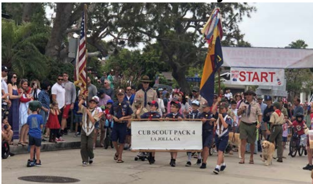
A neighborhood tradition since 1980