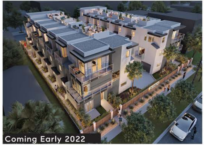
Coming Early 2022