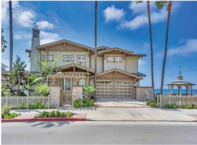
Ultimate Oceanfront Lifestyle 274 Coast Blvd | $13,795,000