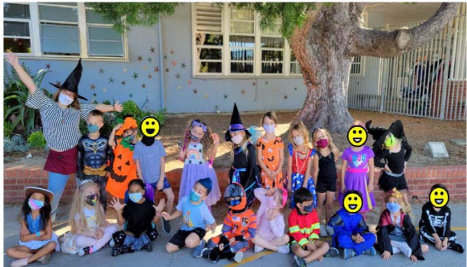
More Bird Rock Elementary School Halloween and Fall Festival photos on page 3

HAPPY HOLIDAYS from the Bird Rock Community Council