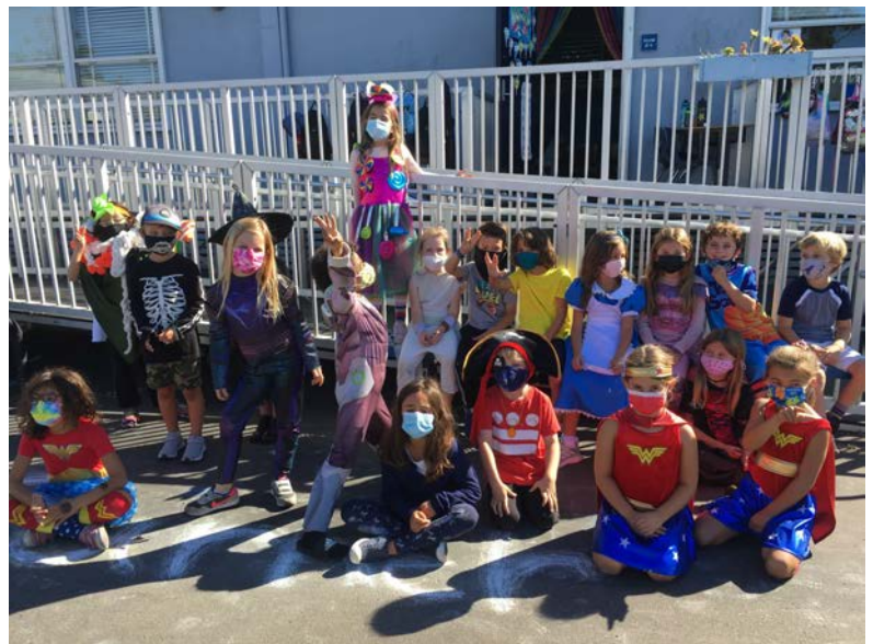
Boo-tiful First Graders