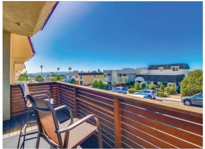
Sunset Views in Bay Park 2649 Hartford St | $1,187,000