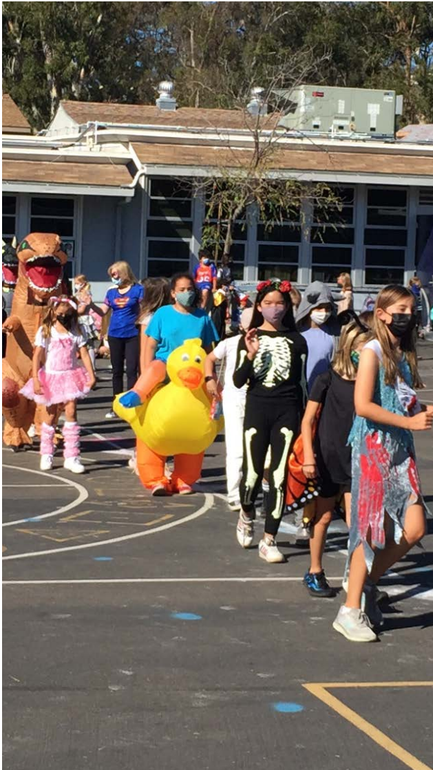
BRE 70th Annual Halloween Parade

School spirit is high as our long beloved school makes its way through these challenging times. What never changes, even after 70 years, is the commitment, dedication, and professionalism of our staff to our neighborhood's children and the enthusiasm of our students for the school life that is blooming in the heart of our Bird Rock Community. Happy New Year, everyone!