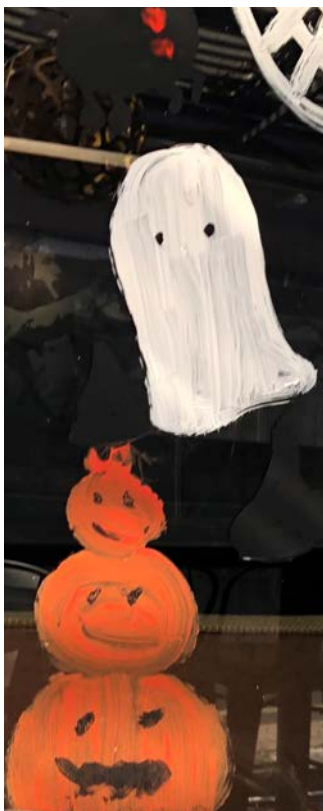
Halloween window painting in the Bird Rock Business District