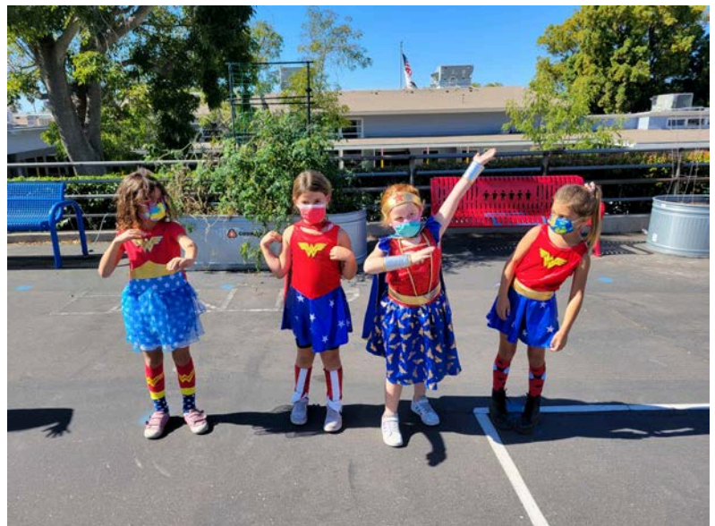
Wonderful Wonder Girls