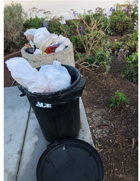
Midway St. Ocean Overlook