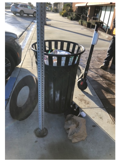
BRCC Waste Containers along La Jolla Blvd near Midway St., Forward St., and Camino de la Costa