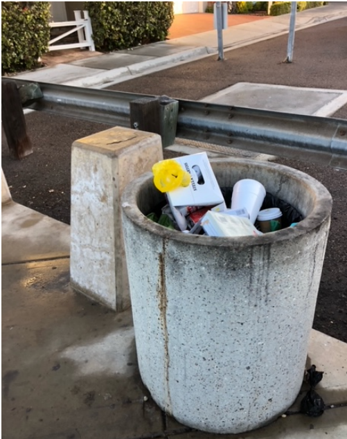
Bird Rock Ave. Ocean Overlook