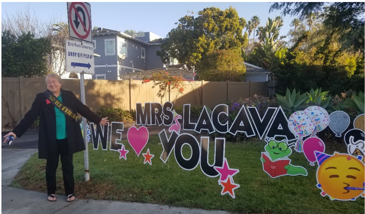
Lorene LaCava, pictured at her December 18, 2020, retirement celebration.

Former kindergarten student Stella Mae Lanuti (Sea Side Yard Cards entrepreneur) set up a wonderful display of gratitude through her yard card company to kick off the retirement festivities which included a surprise parade as nearly 50 cars containing current and former pupils and family members paraded past.