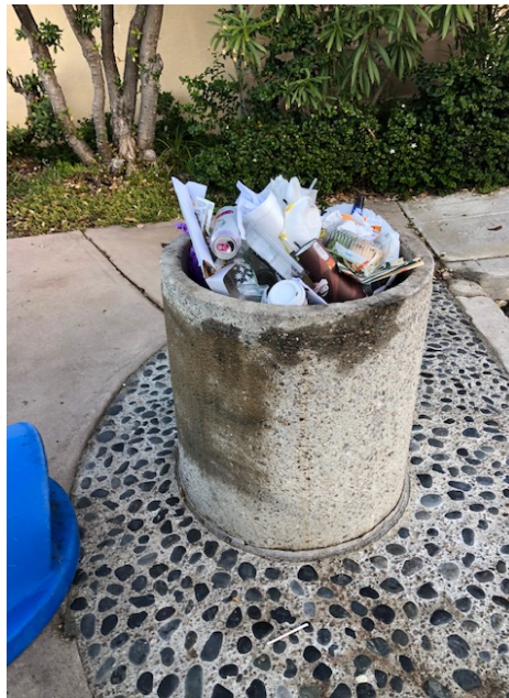
Forward St. Ocean Overlook