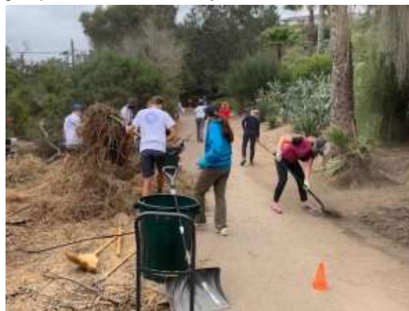
Volunteers work to clear a narrow path section