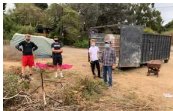
Preparing to carry debris to an EDCO dumpster