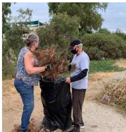
One of 60 bags being loaded with trash, dead vegetation, and debris