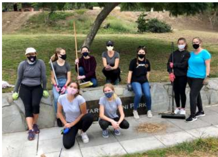
Service group members at Starkey Mini Park