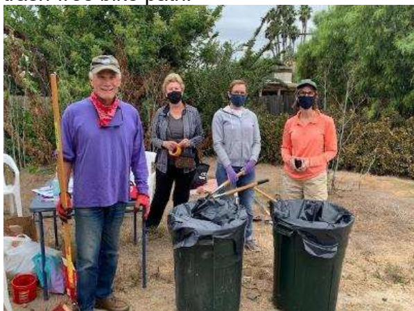
Volunteers checking in

Thanks to all 90+ volunteers including neighbors and members of service groups such as National Charity League (Seaside Chapter), National League of Young Men (classes of 2022 and 2024), Lion's Heart (teen volunteers), and Kiwanas for making a difference in our community. The result is a cleaner, safer, trash-free bike path.