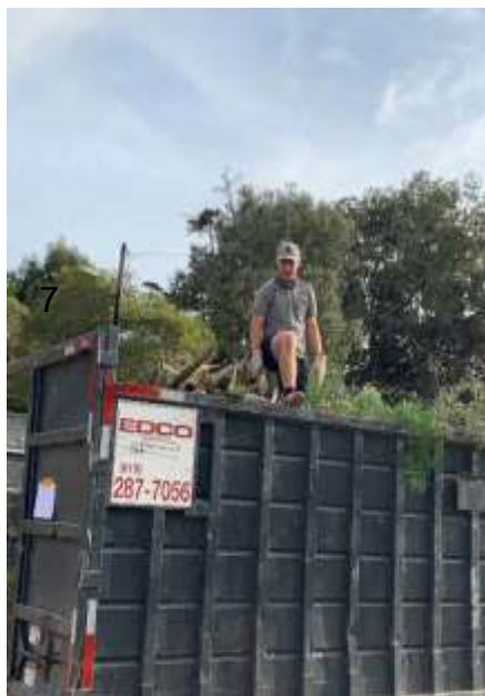
Topping off the dumpster